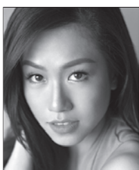
Rachelle Ann Go